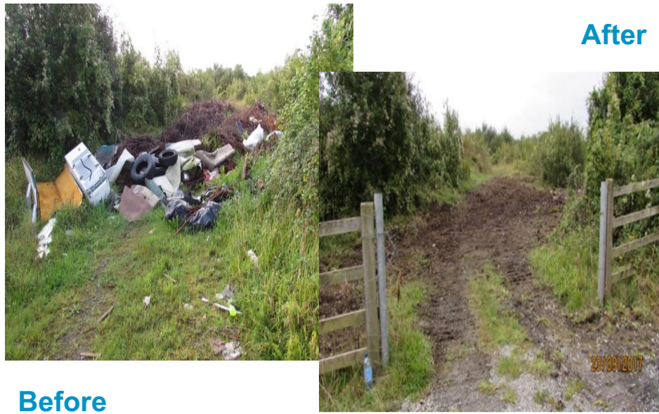
N68 Slip Road, Ennis, Co. Clare