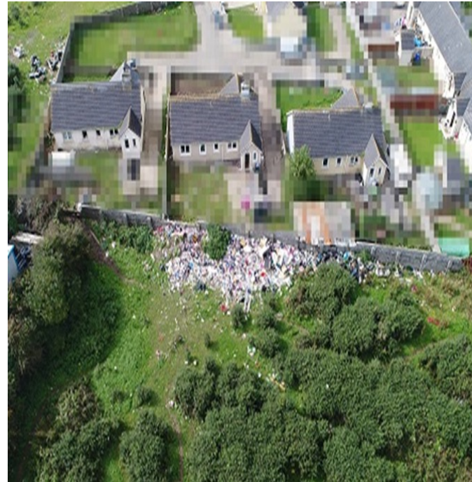
Operation Spóta Dubh Housing Estate, New Ross, Co. Wexford