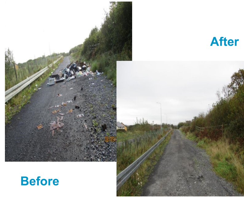
Rocky Road Roundabout, Ennis, Co. Clare